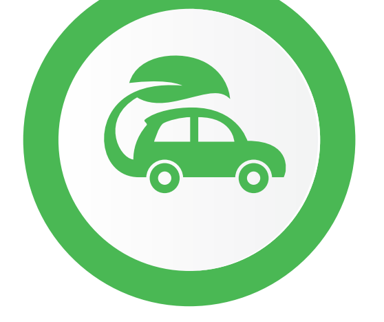
Less fuel poverty