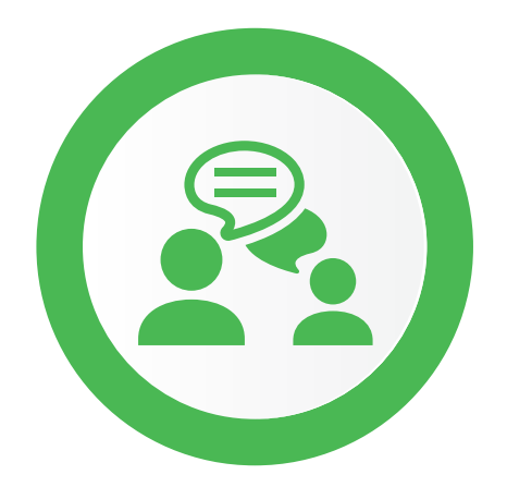
Greater lobbying power